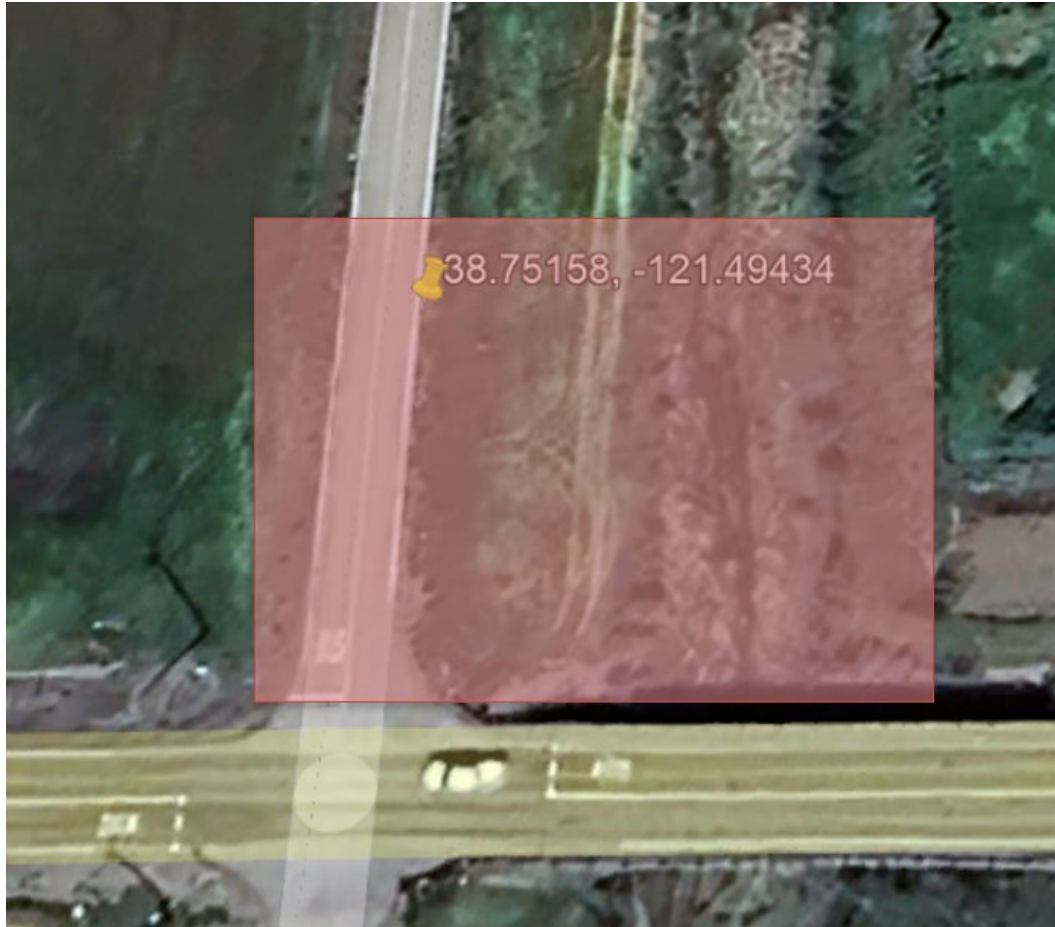
Attachment 3. Approximate project footprint map